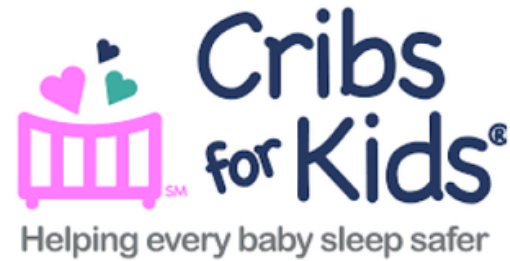
Preventing Infant Deaths

Adults $25 or Buy 5 Tickets for only $100 Children under 12 only $20 / Ticket (Includes Mini Golf, Cash Prizes, Raffles, Food and Soft Drinks)