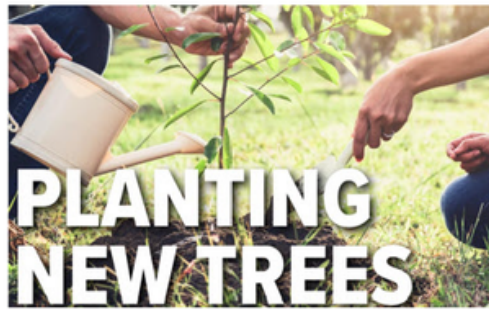
Tree-Plantings with TreesCharlotte