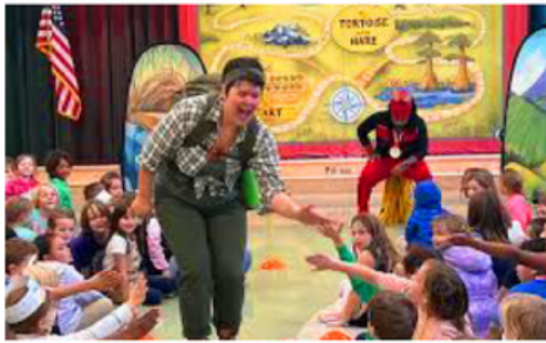
Opera @ Title I Elementary School

On Indigenous Peoples' Day, Monday, Oct 9, 2023!! From 4 pm - 6 pm at High Seas Miniature Golf , Ft. Mill, SC Help support three charity initiatives Organized by Charlotte North Rotary Club (71st Year!)